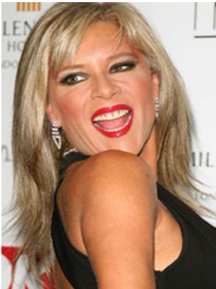
11. Who? 12. Co-presented the BRIT Awards with who?