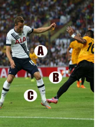
6. Spot the ball? 7. Player on the left?