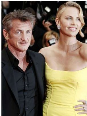
13. On the left? 14. On the right?