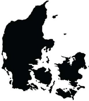
8. Which country? 9. Its capital city?