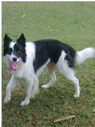
18. What breed of dog?