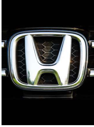
3. Which company logo?