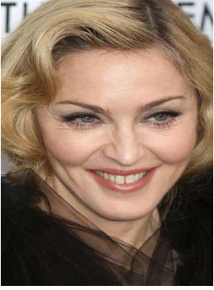
1. Who? 2. Married how many times?