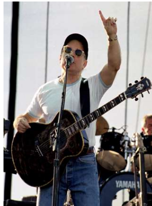
11. Who? 12. Co-presented the BRIT Awards with who?