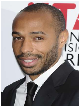
16. Who? 17. Scored 35 goals for which club?