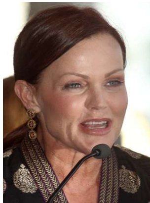
19. Who? 20. Her best-selling song?