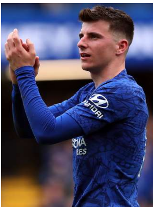
16. Who? 17. Currently at which club?