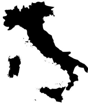
8. Which country? 9. Its capital city?