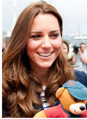
4. Who? 5. Her famous husband?