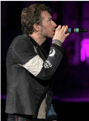
11. Who? 12. From which band?