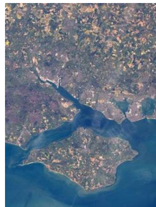
18. Which island?