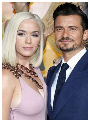
19. On the left? 20. On the right?