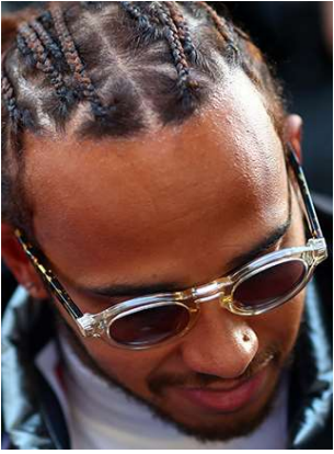
1. Who? 2. World champion in which sport?