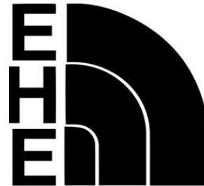
15. Part of which logo?