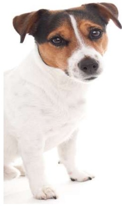
3. Which company logo?